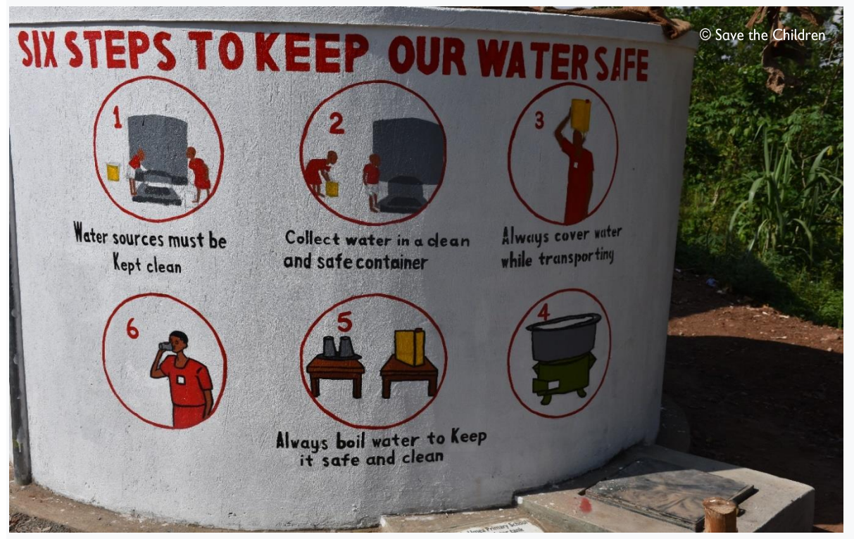
To raise awarness the 6 key steps to use water safely has been painted above the well