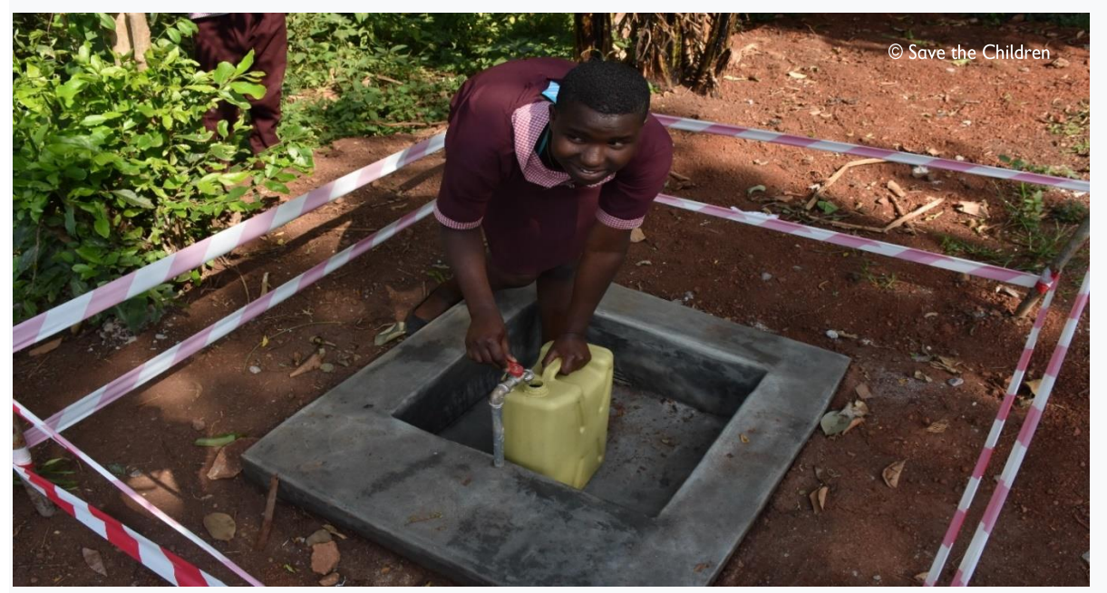
Student easily fills a tank of water from the new tap installed close to the well