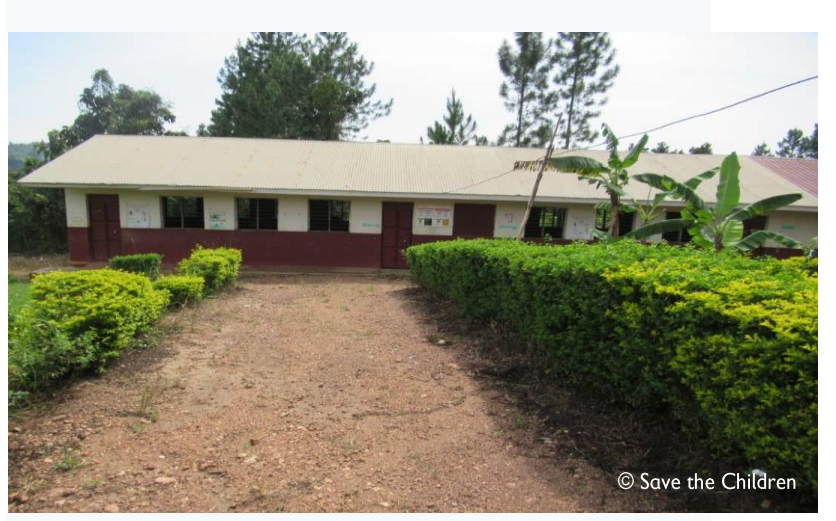
The Ttikalu Umea Primary School

The tank can hold 10,000 liters of water . A breathable paint was applied around the tank to convey, through simple illustrations and writings in English and Swhaili, the 6 key steps to use water safely.